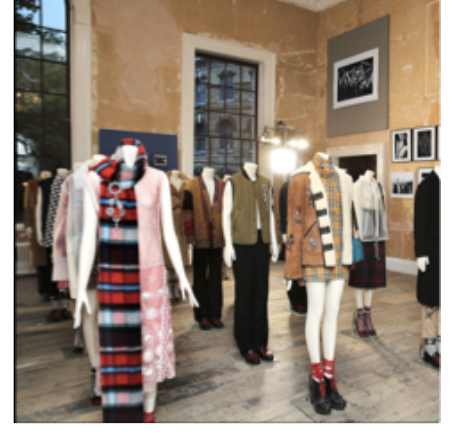
BRAND EVENTS launches/ experiential events Day/evenings/Night