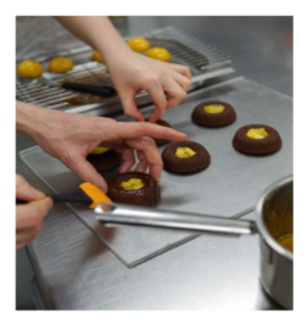
WORKSHOPS Interactive focused on development Day/early evenings

RECEPTIONS High end cocktails & canapes receptionsDay/evenings/Night