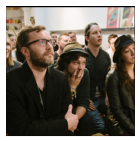
TALKS Inspirational speakers/Q&A Day/Early evening