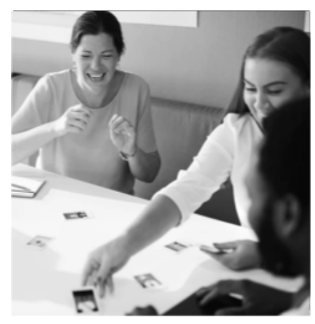
ROUND TABLES Intimate debates & discussions Day/Early Evenings