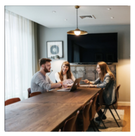
MEETINGS Company Away Days Day